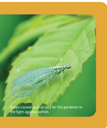
Green Lacewing is an ally for the gardener in the fight against aphids