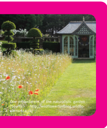
One embodiment of the naturalistic garden